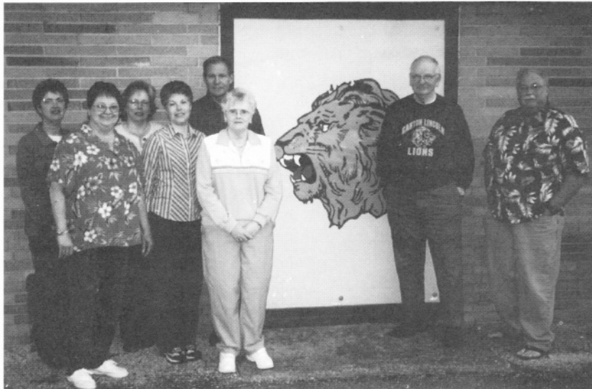
2008 CLHSAA BOARD MEMBERS -- ALL VOLUNTEERS!